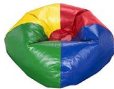
bean bag chairs